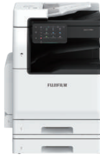
With 1 Tray Module

Standard Tray • 520 sheets capacity tray x 1-tray