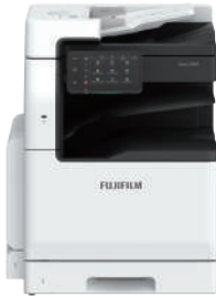
Standard Configuration 1 Tray

Standard Tray • 520 sheets capacity tray x 1-tray