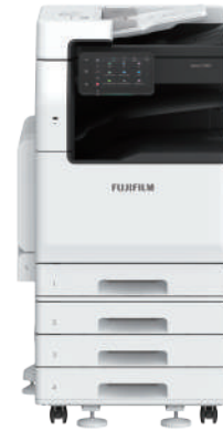
With 3 Tray Module

With 1 Tray Module • 520 sheets capacity tray x 2-tray