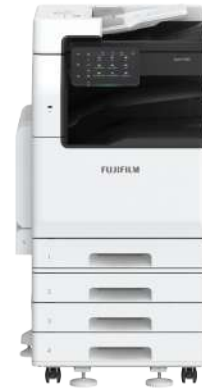
With 3 Tray Module

With 1 Tray Module • 520 sheets capacity tray x 2-tray